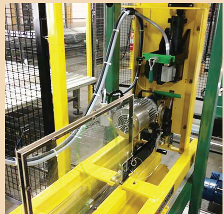
Complete carriage assembly with mounting brackets and hardware