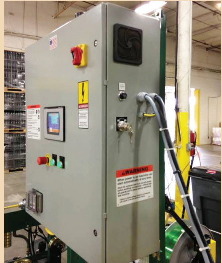
Electrical control package with Allen-Bradley components and a 6" HMI

The MH-BGU Conversion includes an updated electrical package that features built-in diagnostics to simplify troubleshooting and minimize downtime. Other features include PLC or VFD access from outside the panel and a service on/off key switch.